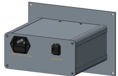
Back face for NTP/230 VAC Version Cable supplied: 3m Ethernet CAT5E, and 2 m Power AC EU/IEC C13.

Remote configuration and time setting via WEB interface. Automatic time zone choice and daylight saving time change. Supervision via SNMP, configuration via Telnet, IP configuration with 'GT Network Manager' (Windows ® NT/XP/2000/Vista (32 bits)/ Windows 7)